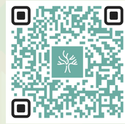
Charitable Donation via New Ventures & Bayview Glen Alliance

Commit to consistently sharing, watching and engaging live streams and videos, significantly boosting online presence and viewer metrics.