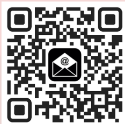
Website Contact Me

Help maintain and grow our ministry to deliver consistent, high-quality content and engagement with our audience.