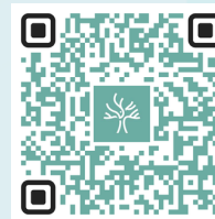
Slow Charitable $ Donos